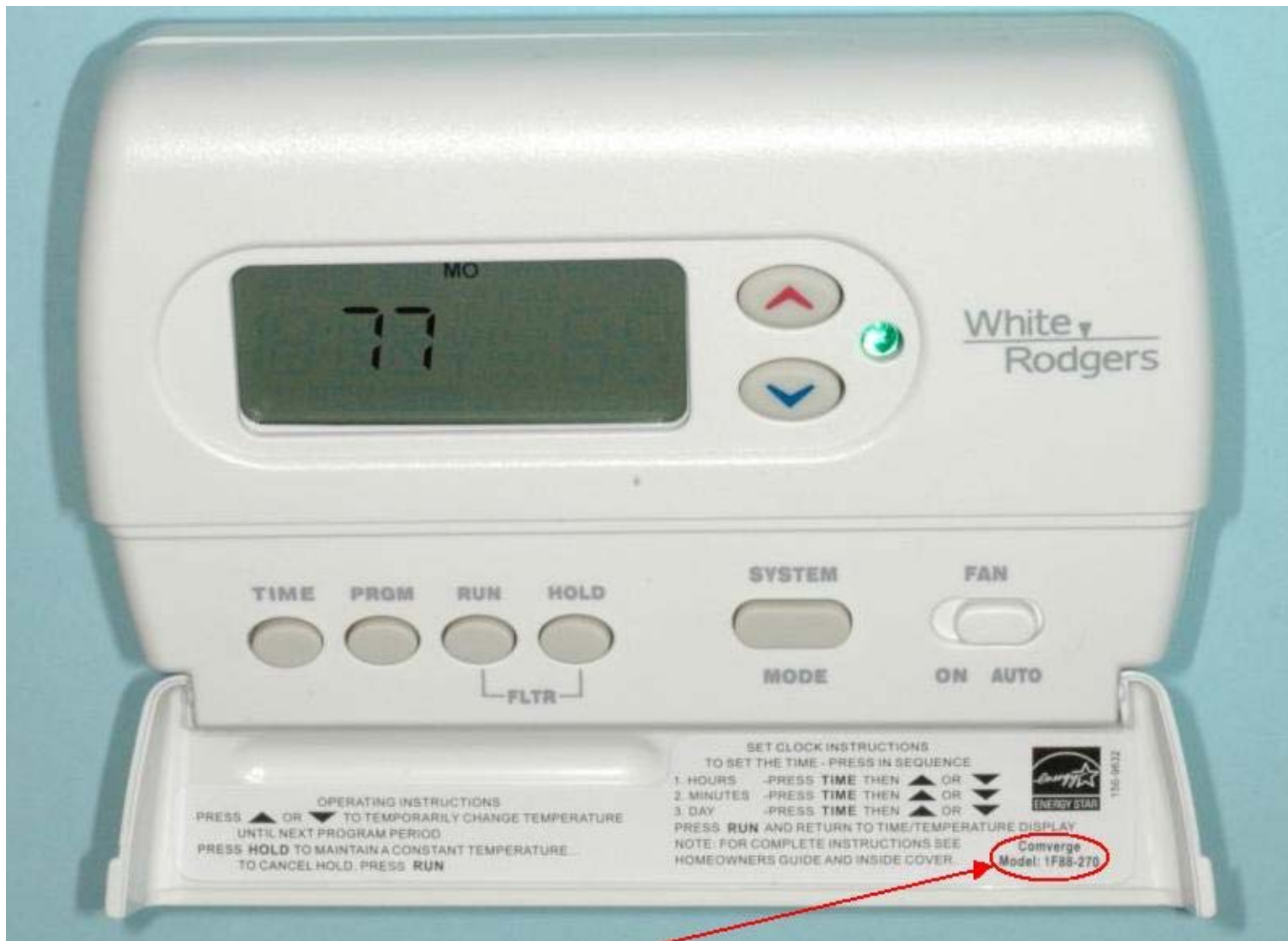
Location of Model Number