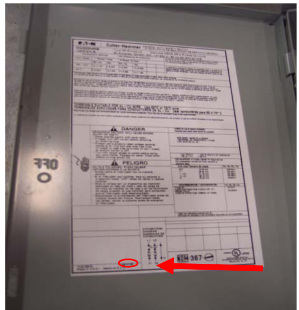
Figure 2: The red circle indicates where the date code is located on the pub inside the cover of the switch