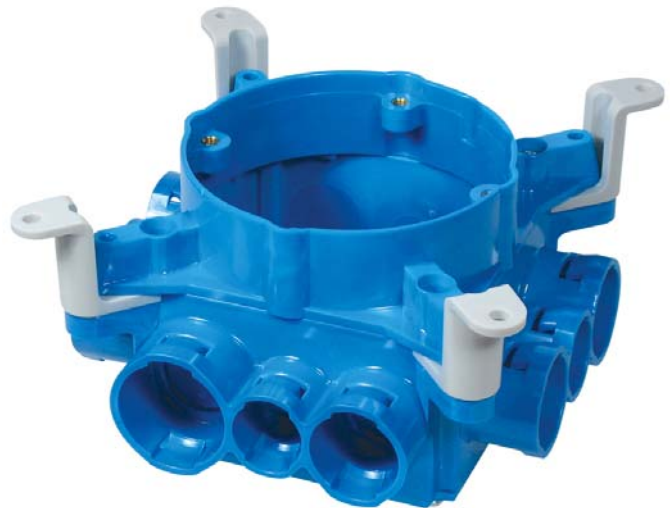
A863CFF and A863CFGF

If you have installed one of these products,