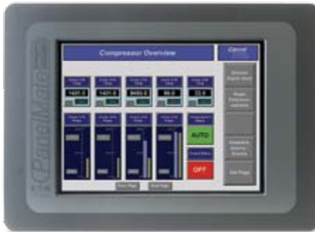
ePro PS: 8.4" to 15" and Blind Node Windows XP Embedded

Three hardware families—one software package