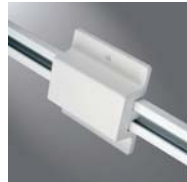
LZR202 Floating Canopy and Connector Feed