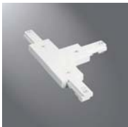
LZR213L Left Handed "T" Connector