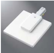
LZR200 Live End Feed with Junction Box Cover