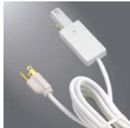
LZR208 Cord and Plug Feed