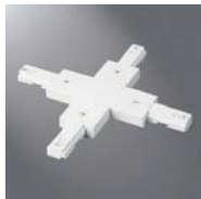
LZR214 "X" Connector