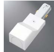
LZR204 Conduit Adapter Feed