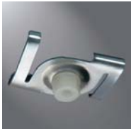
LZR207 T-Bar Mounting Clip