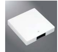
LZR206 T-Bar Canopy