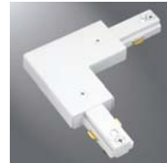
LZR203 Adjustable L and Straight Connector Feed