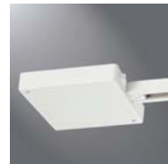
LZRC201, LZRC203 Current Limiters

Specifications and dimensions subject to change without notice. Consult your Cooper Lighting Representative or visit www.cooperlighting.com for available options, accessories and ordering information.