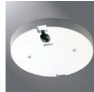
LZR210 Monopoint Feed - Low Voltage