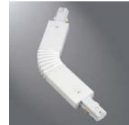
LZR211 Flexible Connector Feed