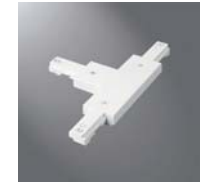
LZR213R Right Handed "T" Connector