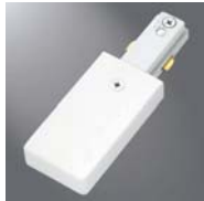
LZR201 Live End Feed