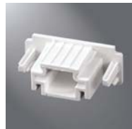
DE112 Dead End