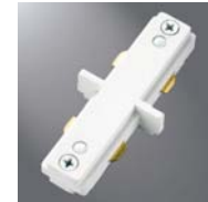
LZR212 Mini Connector