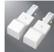
LZR205 Conduit Continuation Feed