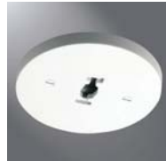
LZR209 Monopoint Feed