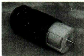
SAFEWAY® 50A CONNECTOR