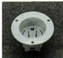
SAFEWAY® FLANGED INLET