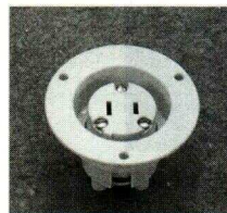
SAFEWAY® FLANGED RECEPTACLE