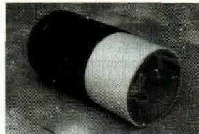
SAFeway® 50A PLUG