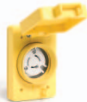
WATERTITE® SINGLE FLIP LID