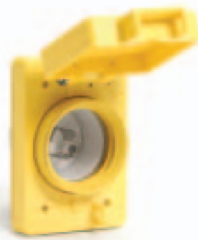
WATERTITE® FLIP LID W/ MALE RECEPTACLE