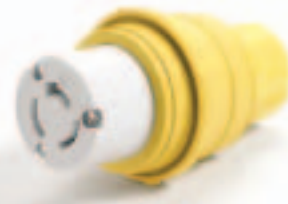
WATERTITE® CONNECTOR FOR FLIP LID W/ MALE RECEPTACLE