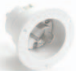
SAFEWAY® FLANGED INLET