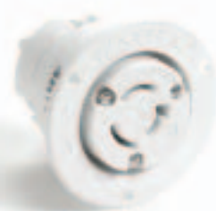
SAFEWAY® FLANGED RECEPTACLES