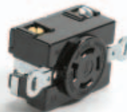
SAFEWAY® SINGLE RECEPTACLE