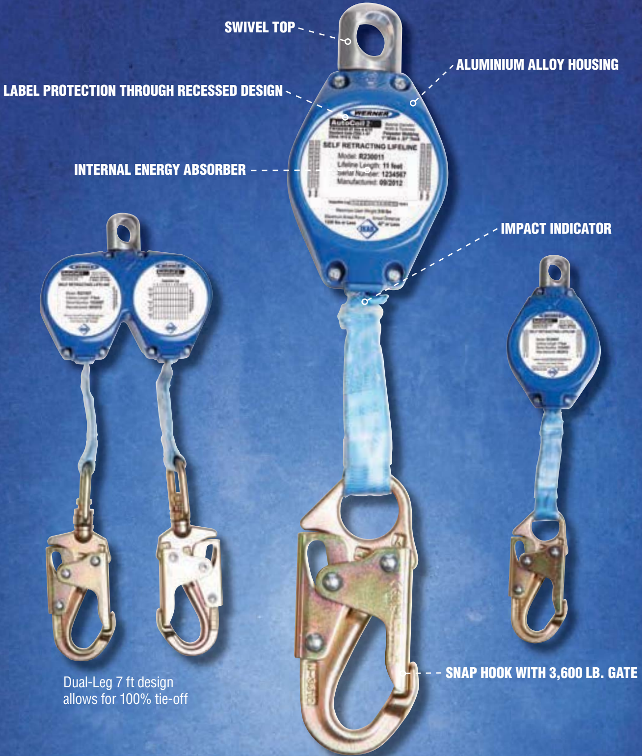
Dual-Leg 7 ft design allows for 100% tie-off