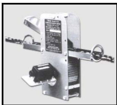
Model 1430 - U.S./Model 1440 - Metric