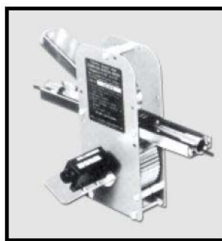
Model 1450 - U.S.