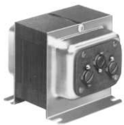
Cat. No. 598