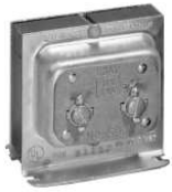
Cat. No. 590