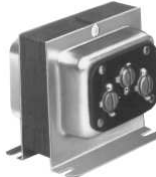
Cat. No. 596