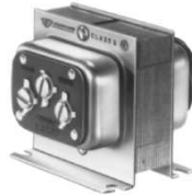
Cat. No. 592