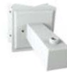
CBR Corner Mount Bracket