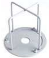
125GRD Protective Wire Guard