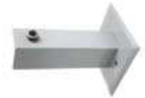
WBR Wall Mount Bracket