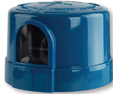
ZTL124-510J-LED Zero-Cross Electronic LED Photocontrol Mounting Turn-Lock