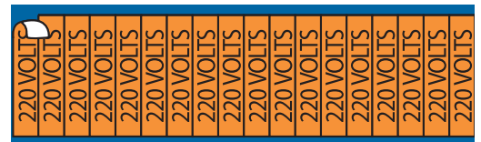
Style C: 2-1/4 in. x 1/2 in. (18 markers per card) Character Height 5/16 in.