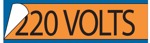
Style A: 2-1/4 in. x 9 in. (1 marker per card) Character Height 1-7/8 in.