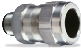
STE Series Ordinary