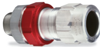
STEX Series Hazardous Locations