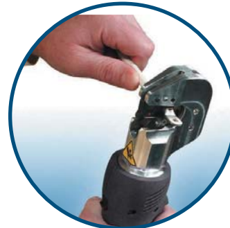
Easy to rotate with your wrist — delivers fast and effective crimping power