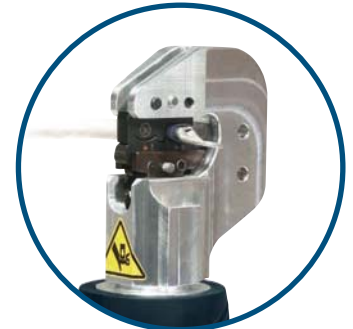
Uses the exact dies of the Comfort Crimp™ line of ergonomic tools for Sta-Kon® and Dragon Tooth™ terminals