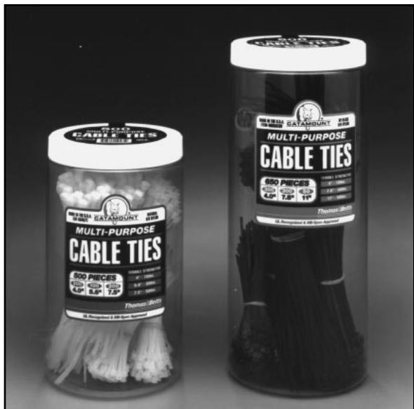
90457-I and 90650-IUV