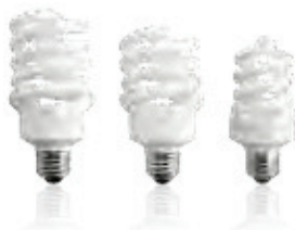
TruStart 58023 Run-up Analysis