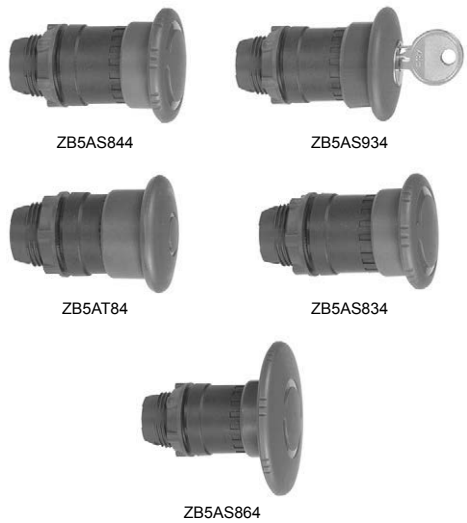
Table 19.140: Mushroom Heads for Maintained Push Buttons