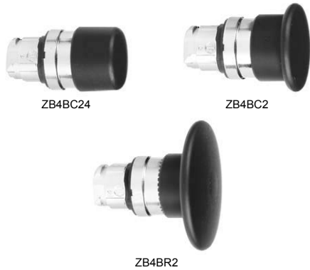
Table 19.77: Mushroom Heads, Momentary