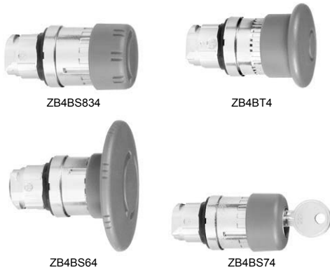
Table 19.78: Mushroom Heads for Maintained Push Buttons