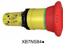
Table 19.207: Ø 40 mm Emergency Stop Trigger Action and Mechanically Latching Mushroom Head Pushbuttons