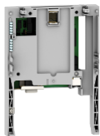
VW3A3316 Ethernet IP communication card - 10/100 Mbps - 2 RJ45

(//www.schneider-electric.us/en/product/VW3A3316/ethernet-ip-communication-card---10-100-mbps---2-rj45/)