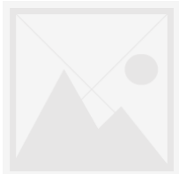
VW3A31201 control I/O card - for variable speed drives Altivar 312

(//www.schneider-electric.us/en/product/VW3A3316/ethernet-ip-communication-card---10-100-mbps---2-rj45/)