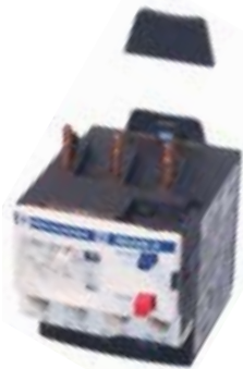
Overload Relay and Spacer (W816366180111)