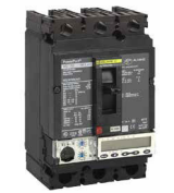
H-Frame Micrologic™ Trip Unit