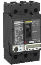
J-Frame Micrologic Trip Unit