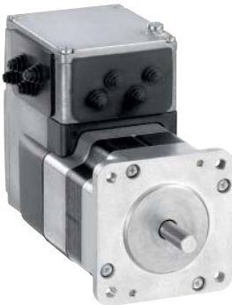
ILE2 integrated drive with brushless servo motor