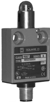
9007MS02 Shown with M12 Connector