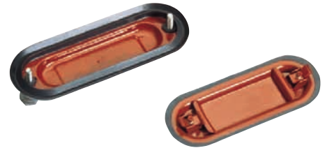
Form 8 &amp; Form 7 Covers