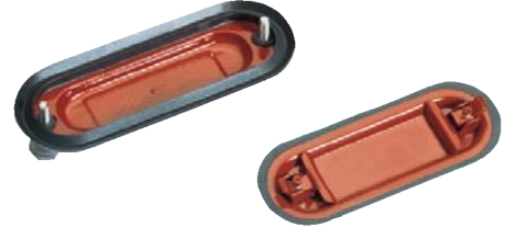
Form 8 & Form 7 Covers