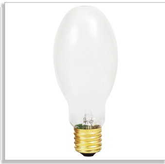
E26, BD-17, Coated