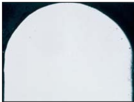
Panduit tie body