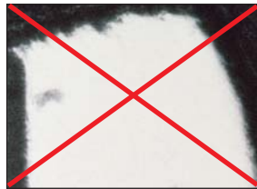
Other manufacturer's tie body

The Pan-Steel® Stainless Steel Cable Tie features fully rounded edges to assure bundle protection and operator safety. Panduit not only removes the burr, but actually passes the material through a secondary process which removes the top and bottom corners of the material.