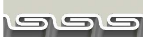
Interlocked Design 1-1/2" through 4" with no bonding wire