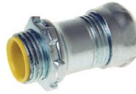
Insulated Throat Connectors Steel