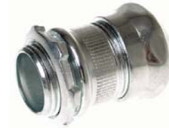
Uninsulated Connectors Steel