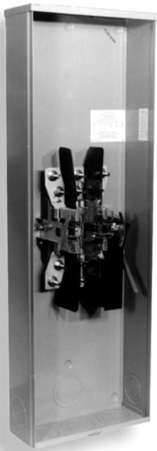
U1779-R-K3-BLG (not shown with -BLG or K3 Connectors)

320 AMP-4 & 7 TERMINAL-LEVER BYPASS-HEAVY DUTY-RINGLESS