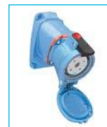
Female Receptacle with Angle Adapter 63-14043 + 61-1A027