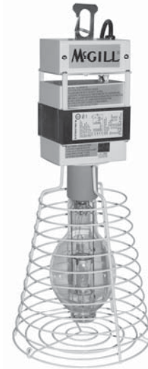
Shown with optional bottom trap