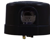
Twist-and-lock Dusk-to-Dawn PhotoCell (included)