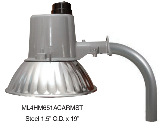
ML4HM651ACARMST Steel 1.5" O.D. x 19" (Shown installed, sold separately)