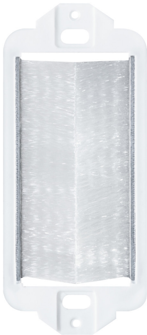
41075-DBW Decora Brush Passthrough Insert

The Decora Brush Passthrough Insert offers a clean, professional appearance when cable needs to pass through a wall opening. The white fibers of the brush protect the cables and close the opening to provide an aesthetically pleasing look. The brush insert installs on standard NEMA electrical boxes and low-voltage brackets. Single- or multi-gang Leviton Decora wallplates (sold separately) complete the installation. Use for home theater, classroom, or conference room audiovisual installations.