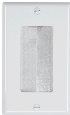
Insert attached to Decora Single-Gang Wallplate (sold separately)