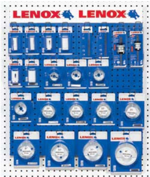
24" x 27" 22 SKU Wall Merchandiser