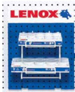
* 12" x 15" 2 SKU Wall Merchandiser