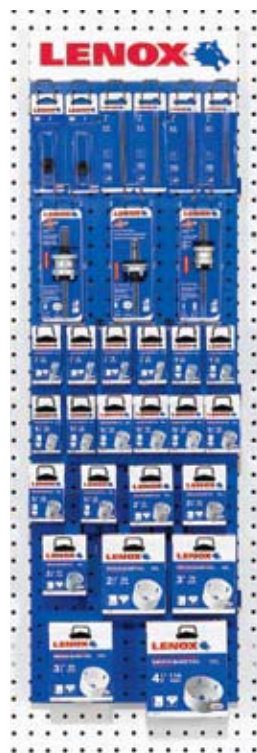
12" x 39" 21 SKU Wall Merchandiser