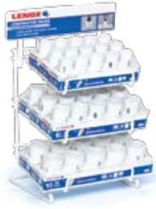
* 8-1/2" x 12-1/2" x 7-1/4" 3 SKU Countertop Merchandiser