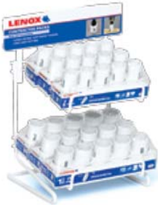
* 8-1/2" x 10-1/4" x 7-1/4" 2 SKU Countertop Merchandiser