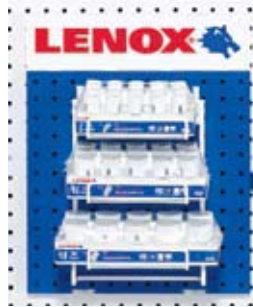
* 12" x 15" 3 SKU Wall Merchandiser