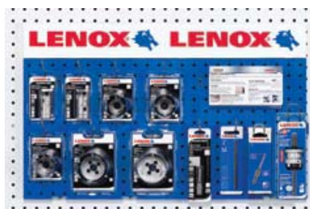
24" x 15" 11 SKU Wall Merchandiser