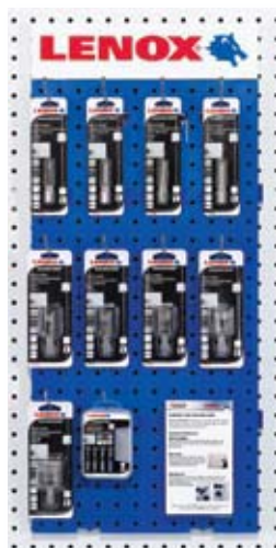
12" x 27" 10 SKU Wall Merchandiser