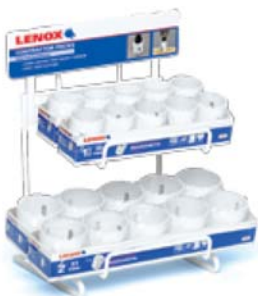
* 8-1/2" x 10-1/4" x 7-1/4" 2 SKU Countertop Merchandiser