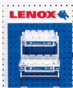
* 12" x 15" 2 SKU Wall Merchandiser