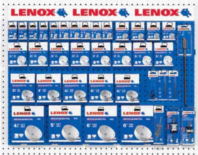
36" x 27" 34 SKU Wall Merchandiser