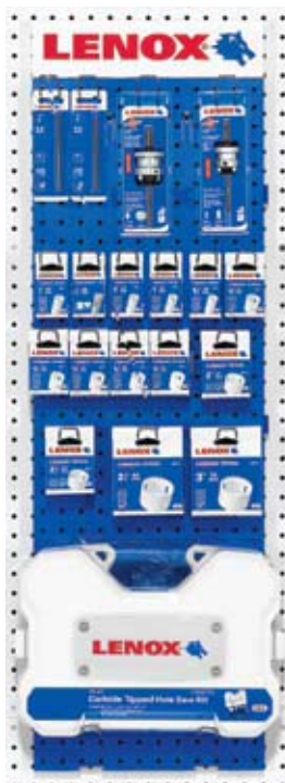
12" x 39" 16 SKU Wall Merchandiser