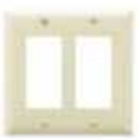
Decorator Openings, Two Gang, Ivory