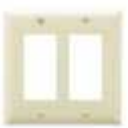
Decorator Openings, Two Gang, Orange