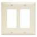
Decorator Openings, Two Gang, Light Almond