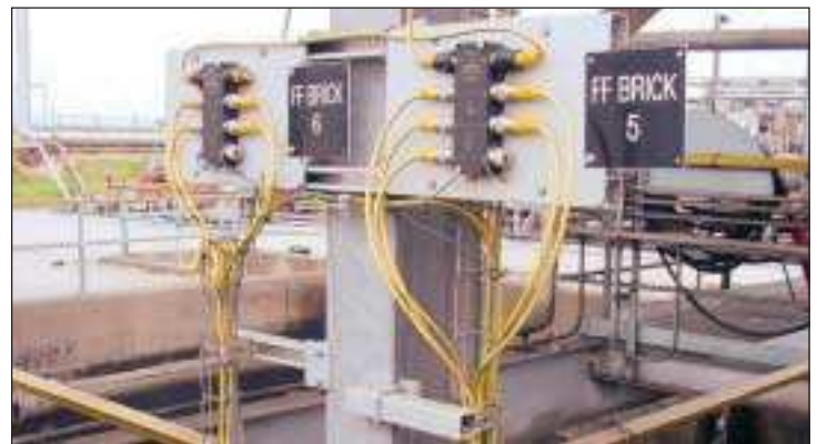
Instrumentation for Industry