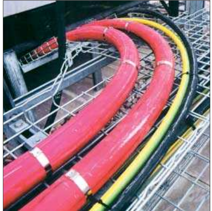
Electrical Power Cable Support