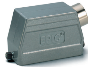
All dimensions are in mm.