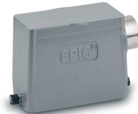
All dimensions are in mm.