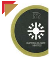
MMT410 3-1/8" Titanium STORM Titanium HSS Metal, Wood, Fiberglass