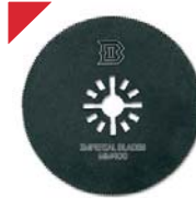
MM400 3-1/8" Full Round HSS Metal, Wood, Fiberglass