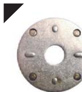
ADSC Fein SuperCut Adapter