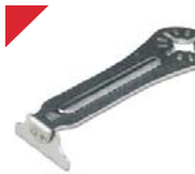
MM390 90° REACH Bi-Metal Hardwood, Laminate, Parquet