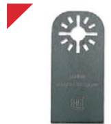
MM415 1-3/8" Deep Plunge HSS Metal, Wood, Fiberglass