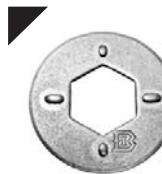
ADRW Rockwell® Sonicrafter Adapter

Adapt the Rockwell® Sonicrafter, Porter-Cable® Multi-Tool, or Fein SuperCut to fit any Imperial Blades accessories