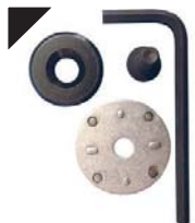
ADPC Porter-Cable® Multi-Tool Adapter KIT