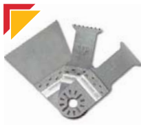
MMV MM150, MM200, MM300 HCS & Bi-Metal Wood, Drywall, PVC, Metal