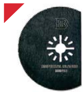
MM410 3-1/8" Segment HSS Metal, Wood, Fiberglass