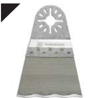
MM550 2-1/2" Wavy Knife Blade HCS Rubber, Insulation