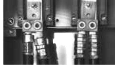
Lug Will Not Accept Straight Pin Offset Pin Design - Application