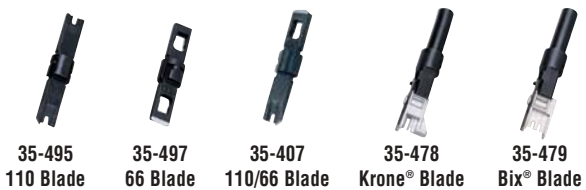
35-495 110 Blade 35-497 66 Blade 35-407 110/66 Blade 35-478 Krone® Blade 35-479 Bix® Blade

Bix® is a registered trademark of Nortel. Krone® is a registered trademark of Krone, Inc.