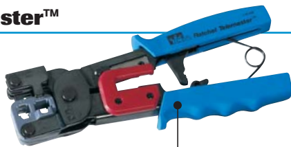
New cushion-grip handles