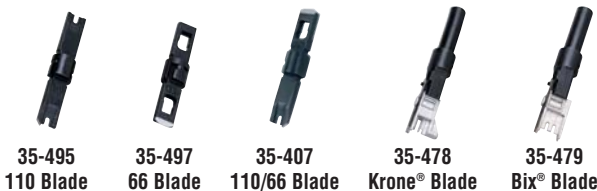
35-495 110 Blade 35-497 66 Blade 35-407 110/66 Blade 35-478 Krone® Blade 35-479 Bix® Blade

Bix® is a registered trademark of Nortel. Krone® is a registered trademark of Krone, Inc.