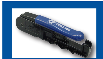
CPLCCT-SLM Utilize This Tool

The FS59BNCU is our Universal "BNC" type connector that fits standard, tri-shield, and quad-shield RG59U coaxial cable.