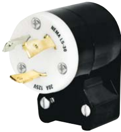
70530NP WITH A 70204ANA