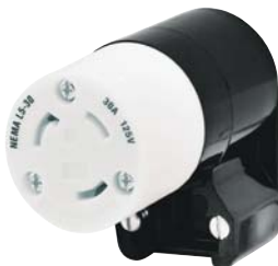
70530NC WITH A 70204ANA