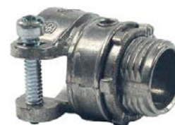
Squeeze Type Uninsulated Die Cast Zinc