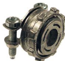
Clamp Type Die Cast Zinc