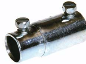
EMT – Rigid Couplings Set Screw Steel